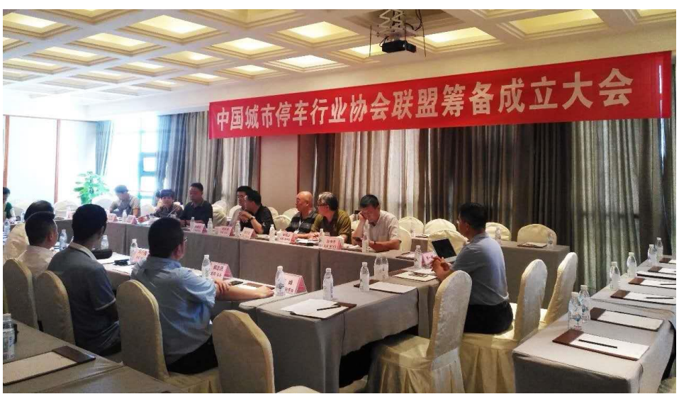
CUPIA was formed by 17 regional parking associations across China in August 2018.

CUPIA was formed by an alliance of regional parking associations*, including SPSTA, in August 2018. Committed to inspiring solutions to serve the growing needs for strategic plans to tackle urban parking problems, it is expected this new co-organiser will spark fresh insights and innovations to Parking China.