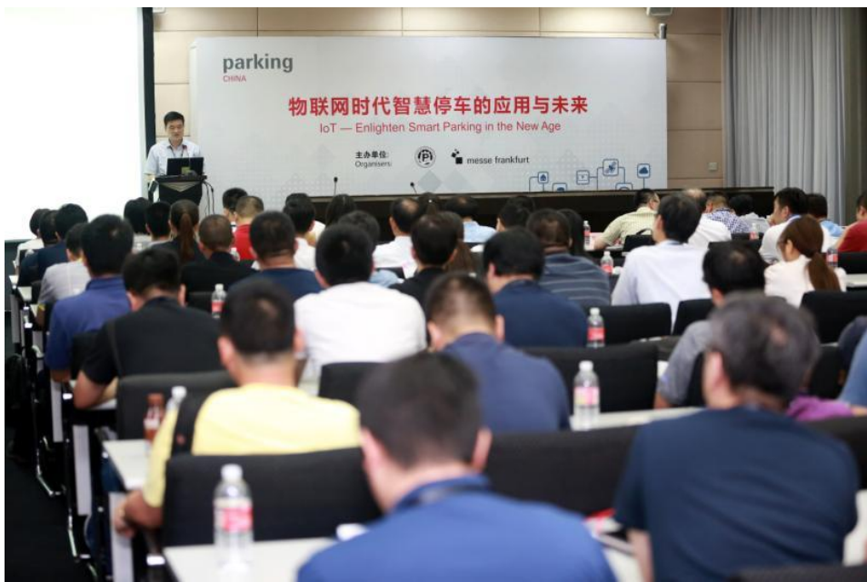
The featured forum "IoT – Enlighten Smart Parking in the New Age" was praised among the attendees at Parking China 2018.

This inaugural collaboration is brought about following successful cooperation between Messe Frankfurt and the Shanghai Parking Service Trade Association (SPSTA) at Parking China 2018. During this fair, the two cooperated on a seminar platform inviting industry elites to address various topics within the sector. The highlighted session "IoT – Enlighten Smart Parking in the New Age" was just one feature of this well-received forum and enjoyed particular acclaim among the audience. It was this satisfying result which encouraged a closer partnership to promote further market intelligence exchange in 2019.